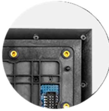
Screws to hold modules in place