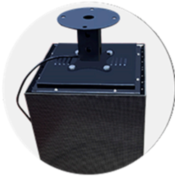
Easy access base plate