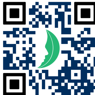
Android/Google Play users